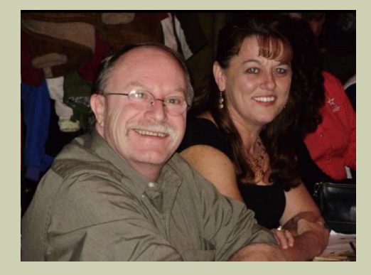
Funeral Service Sunday, February 4, 2024 ~ 1:00 p.m. Stevenson & Sons Funeral Home Miles City, Montana