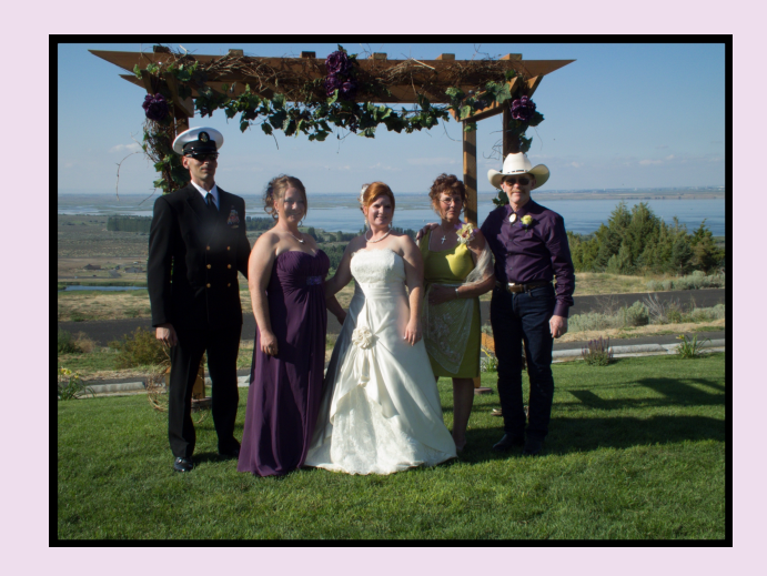
I have fought the good fight, I have finished the course, I have kept the faith. 2 TIMOTHY 4:7