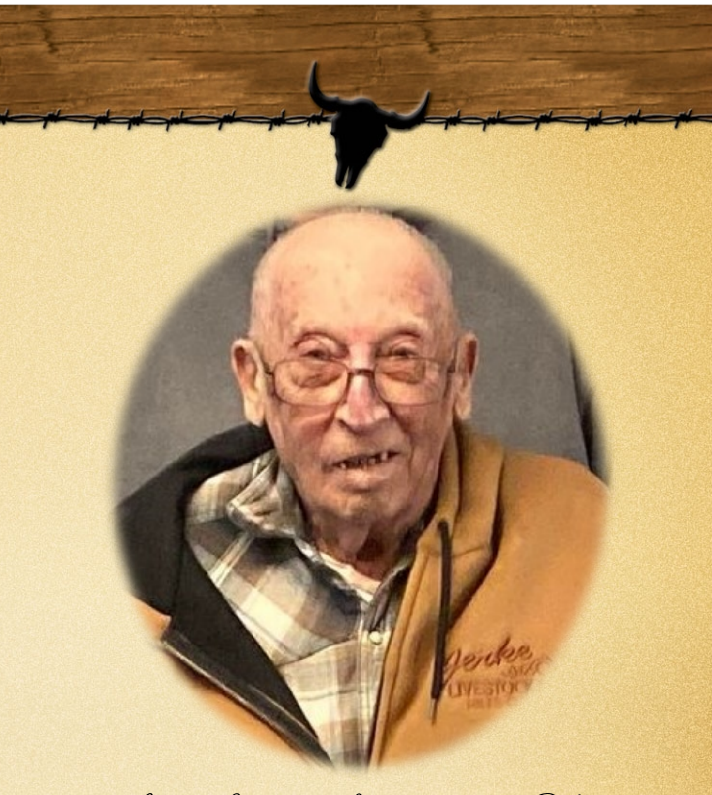
In Loving Memory Of

Arrangements By Stevenson & Sons Funeral Home